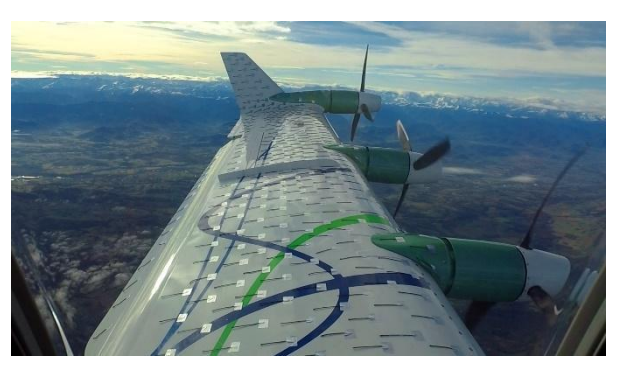
Wing view with the ePropellers activated