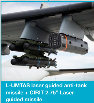
L-UMTAS laser guided anti-tank missile + CIRIT 2.75" Laser guided missile