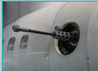
27 mm autocannon and Door Gun System (DGS)