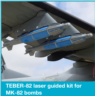
TEBER-82 laser guided kit for MK-82 bombs

The C295 Armed ISR is a long endurance surveillance aircraft equipped with a comprehensive set of laser guided weapons and an EO/IR aimed autocannon to conduct cost-effective Close Air Support (CAS) operations.