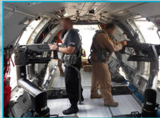
12.7 mm machine guns