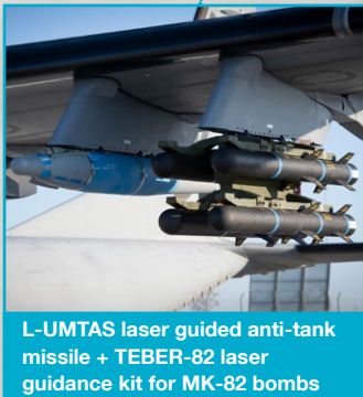
L-UMTAS laser guided anti-tank missile + TEBER-82 laser guidance kit for MK-82 bombs