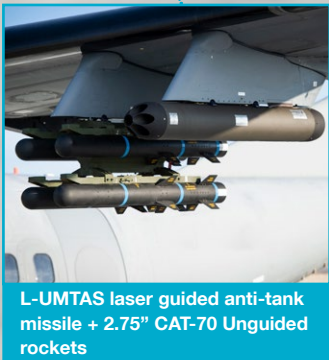
L-UMTAS laser guided anti-tank missile + 2.75" CAT-70 Unguided rockets