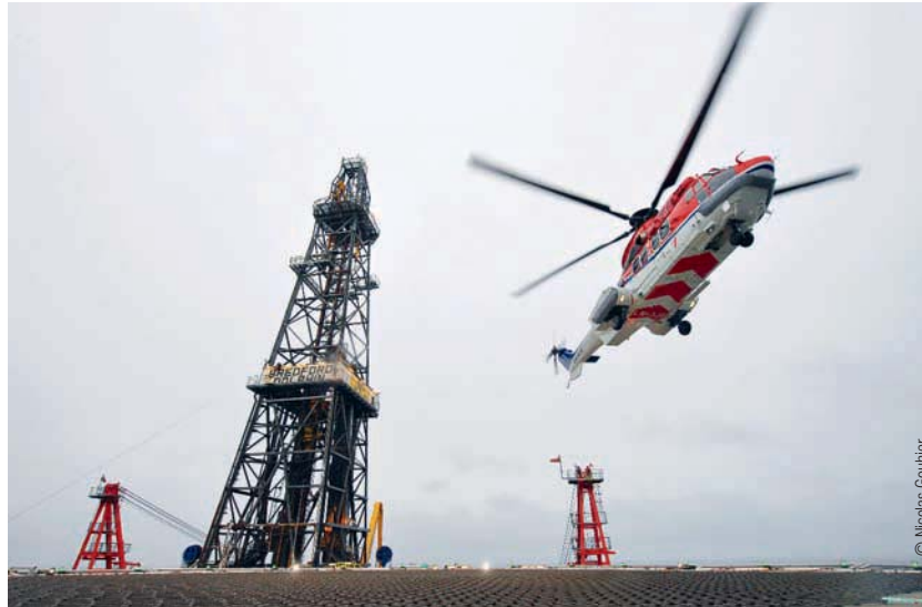
EC225: AN AUTOMATIC PILOT FOR HOVER FLIGHTS