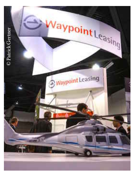
Waypoint Leasing acquired 37 new helicopters during Heli-Expo.

The helicopter leasing market has really taken off, and the impressive number of new orders at Heli-Expo demonstrated the growing role leasing companies are playing in the global expansion of heli-