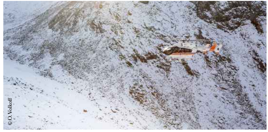
The French Gendarmerie provided theoretical training, followed by flight training, to four pilots who had been selected based on their experience and their aptitude to train other pilots.

ter in many different applications for a wide range of missions. Another difference is that the mountains in Kazakhstan reach heights of 7,000 meters. The EC145 can fly up to 18,000 feet, but it can't work at such altitudes. We all want to do the same thing-provide effective services in the mountains-but there are always limits that must be respected. Whether it's