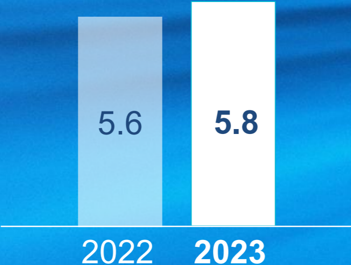
EBIT Adjusted in € bn