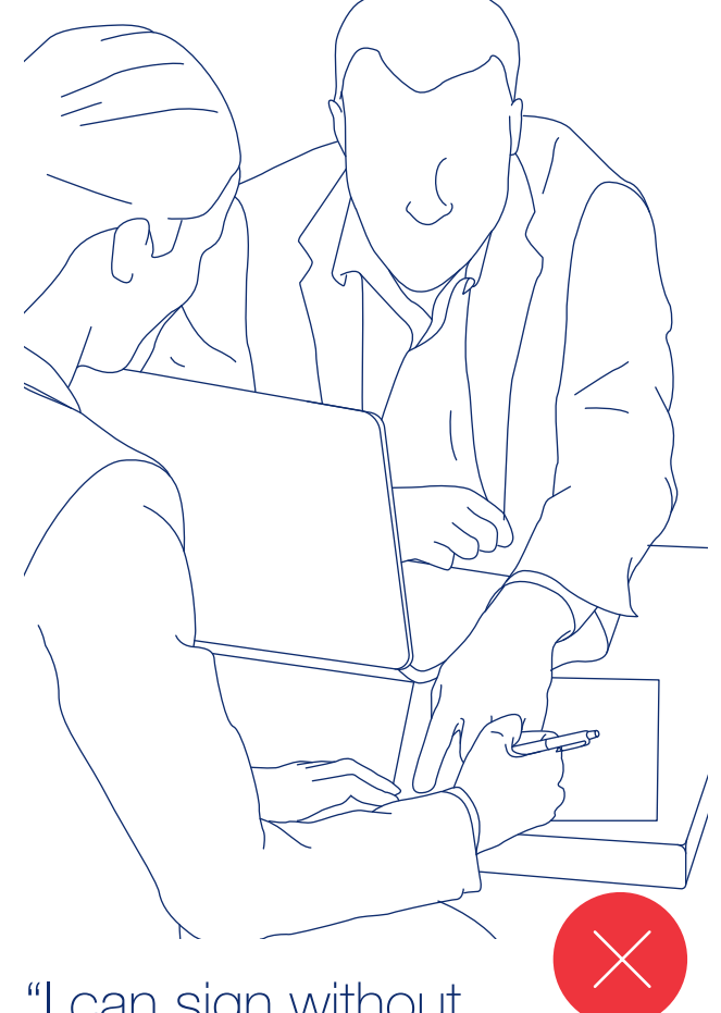
"I can sign without reading the document and rely on the other signatories to do the reading and checking".

Have you experienced something in contradiction with rules & procedures ? Please speak up!