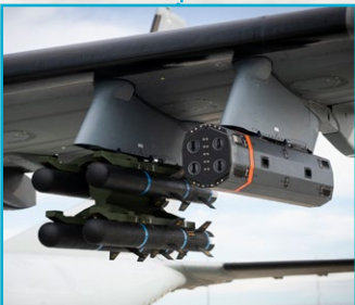
L-UMTAS laser guided anti-tank missile + CIRIT 2.75" Laser guided missile