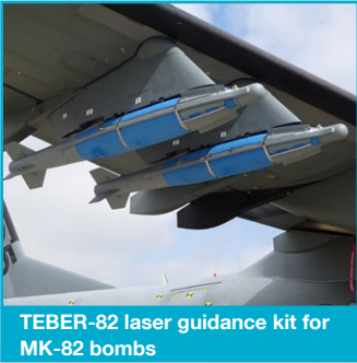
TEBER-82 laser guidance kit for MK-82 bombs

The C295 Armed ISR is a long endurance surveillance aircraft equipped with a comprehensive set of laser guided weapons and an EO/IR aimed autocannon to conduct cost-effective Close Air Support (CAS) operations.