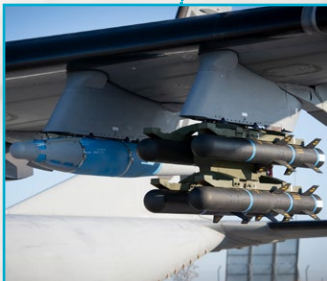
L-UMTAS laser guided anti-tank missile + TEBER-82 laser guidance kit for MK-82 bombs