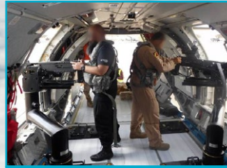
12.7 mm machine guns