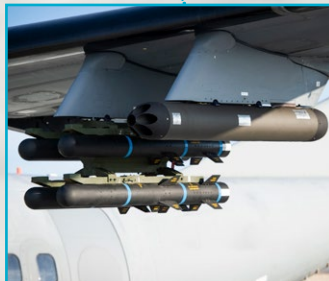
L-UMTAS laser guided anti-tank missile + 2.75" CAT-70 Unguided rockets