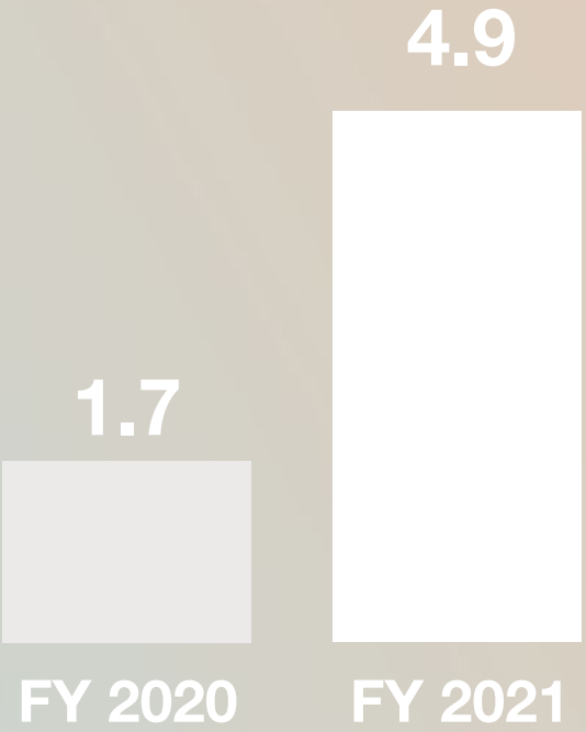
EBIT Adjusted in € bn