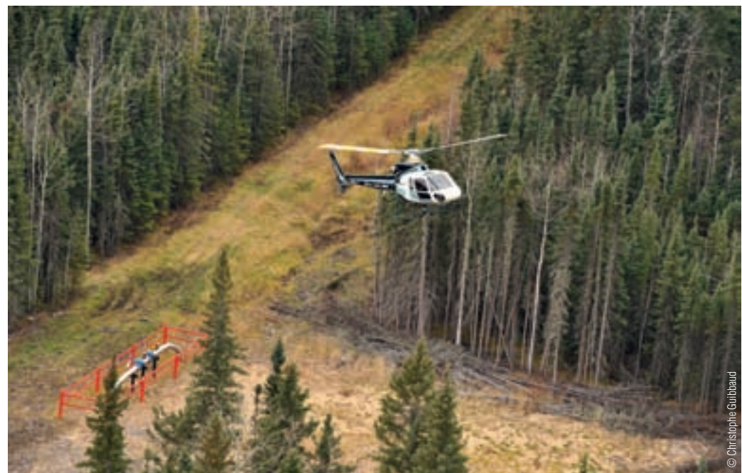
In a single cycle of rotations, the AStar/Ecureuil can transport up to 40 boxes of trees before refueling (about 10,800 saplings in two hours).