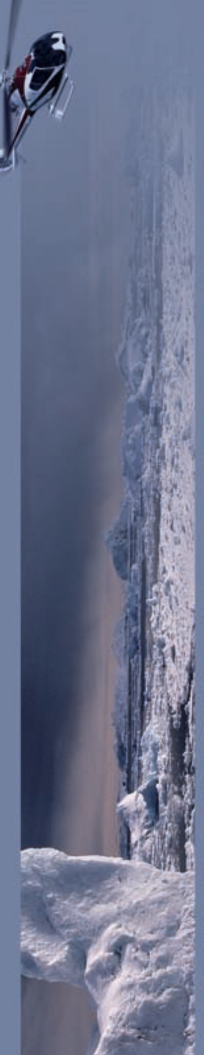
When it cames to protecting the environment, no other helicopters go further.

Scientists surveying Antarctica. Oceanologists researching sealife. Maritime authorities tracking oilspills. Firefighters controlling bushfires. All of them rely on Eurocopter helicopters as essential equipment, Quiet, safe and dependable. Equipped with advanced sensors. Coupled with lower fuel consumption and reduced gas and particle emissions. When you think environmental conservation, think without limits.