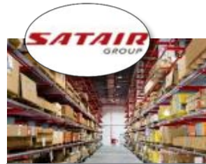
Material & Supply Chain Solutions