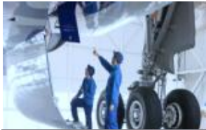
Flight Hours and LRU Solutions

The market is going through a very intense development phase – this means opportunities!