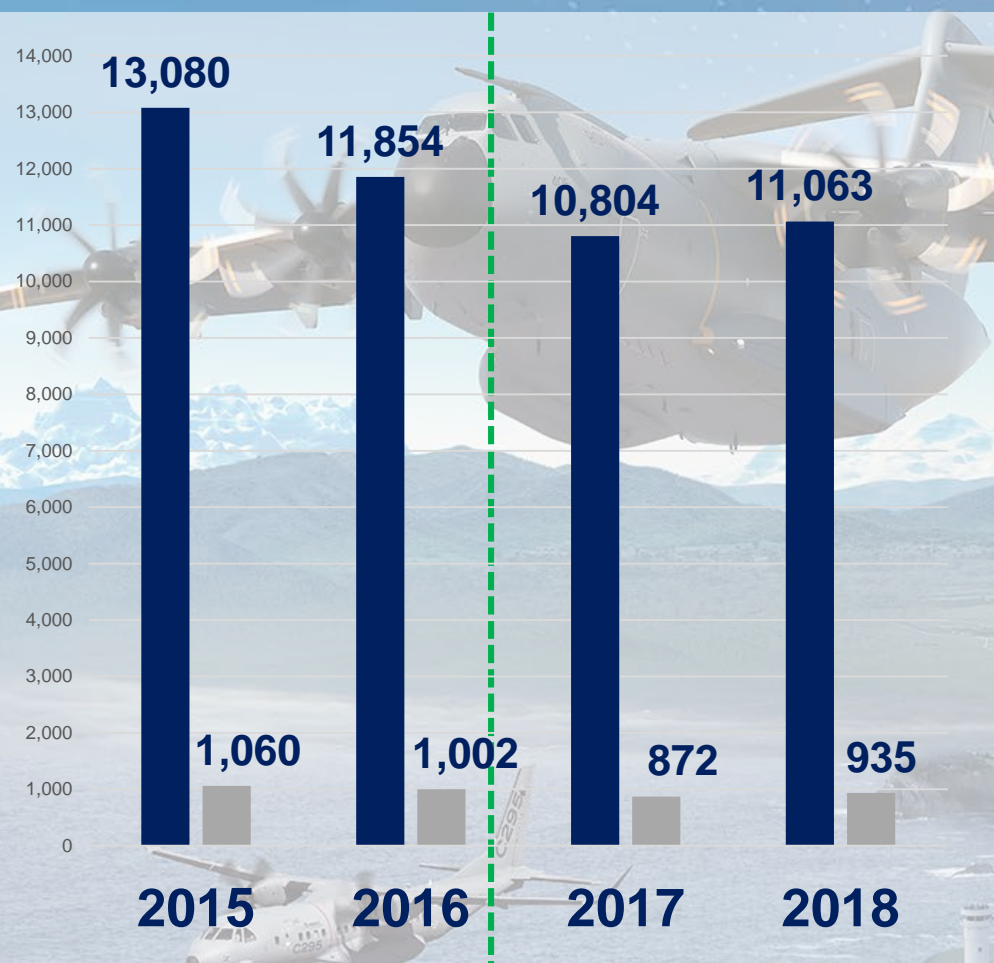
Revenues & EBIT Adjusted Evolution (in € m)

Continuous growth in Revenues and Profitability at constant perimeter