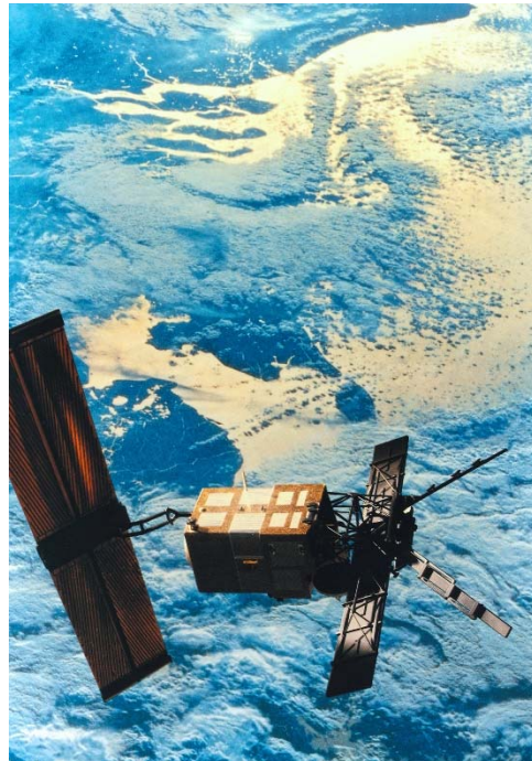
Launched on July 17, 1991, ERS-1 formed the cornerstone of Europe's leading role in Earth observation.

Read more about the development of Earth observation in Europe and an outlook for the coming years.