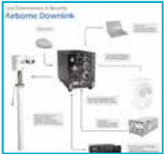
BMS Video Downlink System