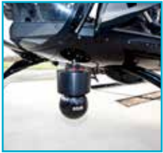
Flir (EOS and display)