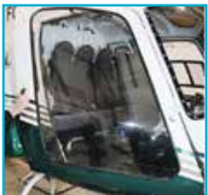
High Visibility Doors