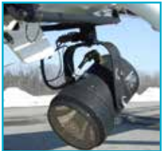
SX-16 Nightsun Searchlight