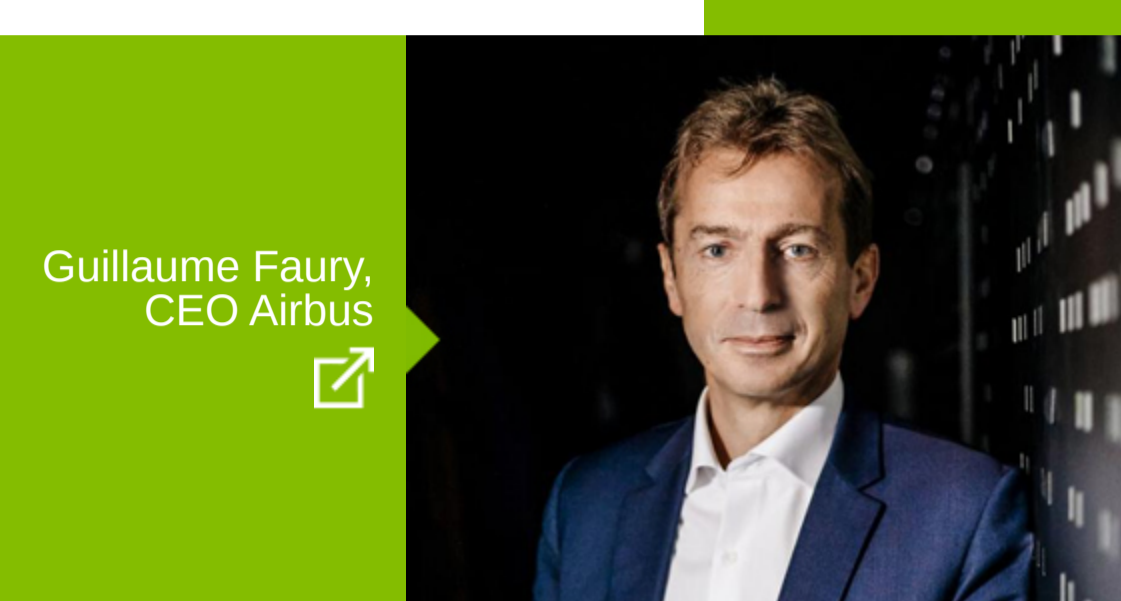
Guillaume Faury, CEO Airbus

Airbus reports Half-Year (H1) 2023 results