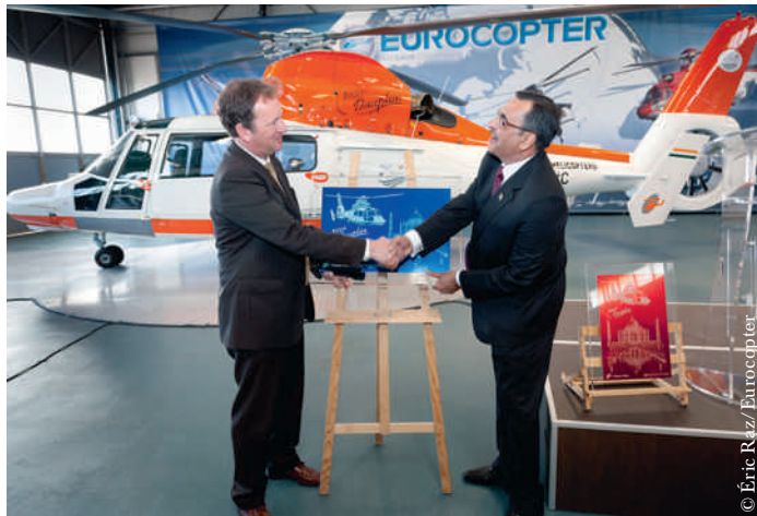
The 1,000th Dauphin was delivered to the Indian operator Pawan Hans on April 19, 2011.