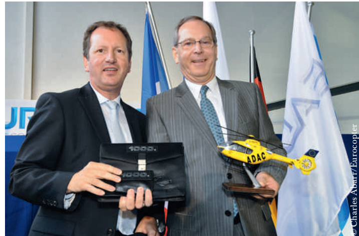
The 1,000th EC135 was delivered to the air rescue services of the ADAC on July 20, 2011.