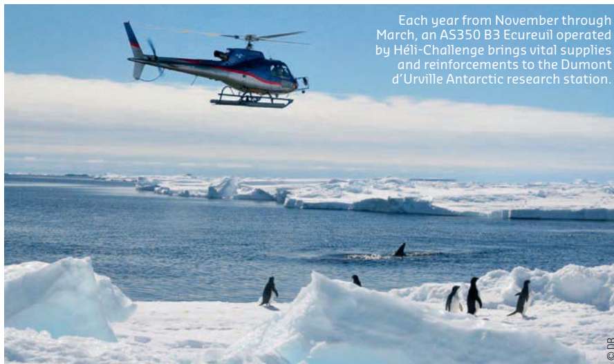
Each year from November through March, an AS350 B3 Ecureuil operated by Héli-Challenge brings vital supplies and reinforcements to the Dumont d'Urville Antarctic research station.