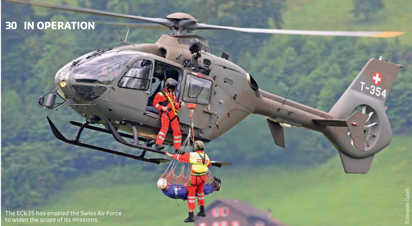
The EC635 has enabled the Swiss Air Force to widen the scope of its missions.