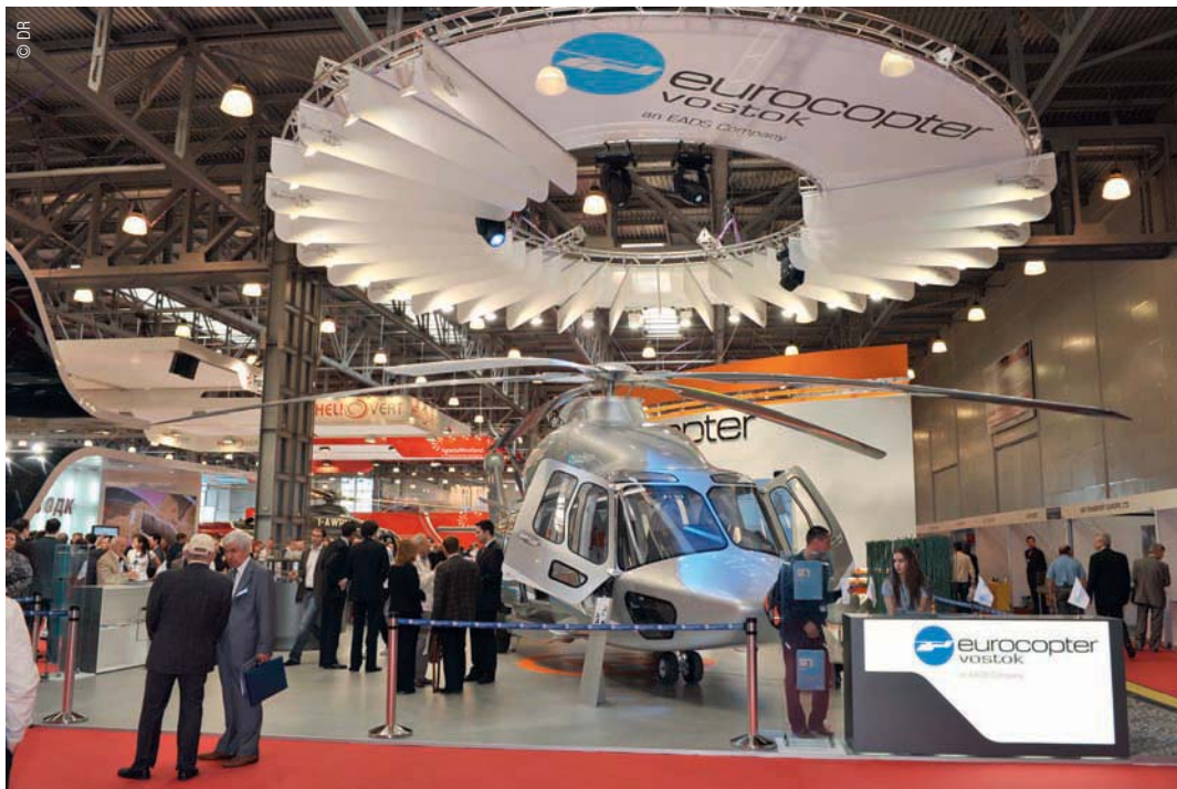
With a 70% share in the local market, Eurocopter is the sole supplier of helicopters to Russia's government agencies and the preferred Western supplier to major operators in the region.

UTair and Sky Services in Kazakhstan. The overriding goal is to see more and more Eurocopter helicopters in the Russian skies, with pilots and technicians trained to use Western technology to guarantee maximum flight safety. "The subsidiary will have to grow in order for our strategy to be a success," concluded Ms. Rigolini. "The top priority of each employee at Eurocopter Vostok will always