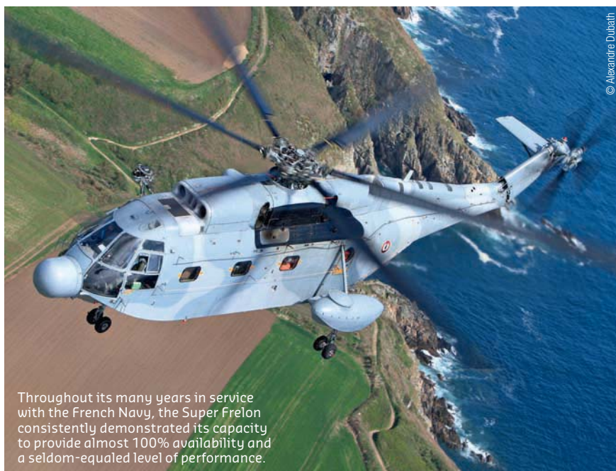
Throughout its many years in service with the French Navy, the Super Frelon consistently demonstrated its capacity to provide almost 100% availability and a seldom-equalled level of performance.

yachts and small fishing vessels, in heavy seas and high winds in the dark of night. There are not many of us in this profession, and we have to work under enormous pressure. We train hard to perfect our know-how and our ability to handle the aircraft under all circumstances. In the heat of the action, when every second counts, the coordination of the helicopter crew is essential. The pilot and the winch operator have to remain in full control of the operating environment. We keep up our motivation by thinking about the people who need to be evacuated: If we don't succeed, it will be a long time before anyone else can come to their rescue. We demand a lot of ourselves, but also of our aircraft, because the success of our missions ultimately depends on our confidence in its performance.