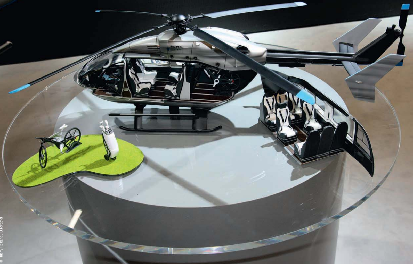
Three cabin layouts are offered, with seats for 8, 6 or 4 passengers. In each case, customers have a wide choice of materials and colors for walls, floors, ceilings and seats, as well as three basic external paint colors.

to gain a firm foothold in the corporate and private segment of the helicopter market. This important segment accounted for 22% of worldwide civil and parapublic helicopter sales between 2005 and 2009, with 880 helicopters delivered to customers, or 16% of sales in terms of value. With deliveries of 440 aircraft, Eurocopter's share of this market over the same period totaled 50%, or 40% in terms of value.