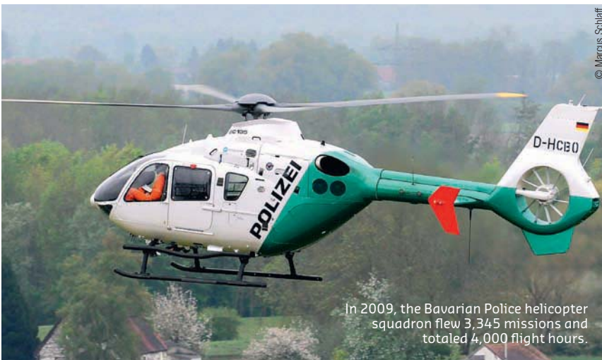
In 2009, the Bavarian Police helicopter squadron flew 3,345 missions and totaled 4,000 flight hours.